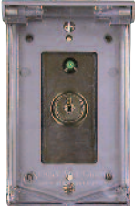
Shown with custom Key switch (switch not included)