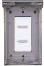
Shown with LightSync switch (switch not included)