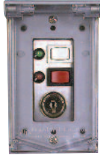
Shown with custom multi switch (switch not included)