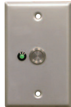
Standard plate mount