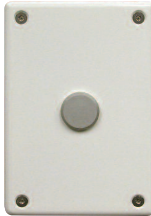
Security plate mount