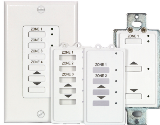
Available in White , Ivory and Gray

The LightSync Digital G2 Multi-Zone Dimmer switch provides control of up to 4 dimmer zones. It provides on/off control and individual/grouped zone dimming with press and hold control. LightSync switch is available in 1, 2, 3, or 4 zone control configurations. This dimmer switch allows the user to select multiple dimmer zones to be controlled at the same time. Uses standard LightSync device addressing and configuration using the ramp up and ramp down operation dimming control option.