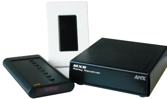
IR (Infrared) unit