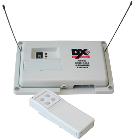
RF (Radio Frequency) unit