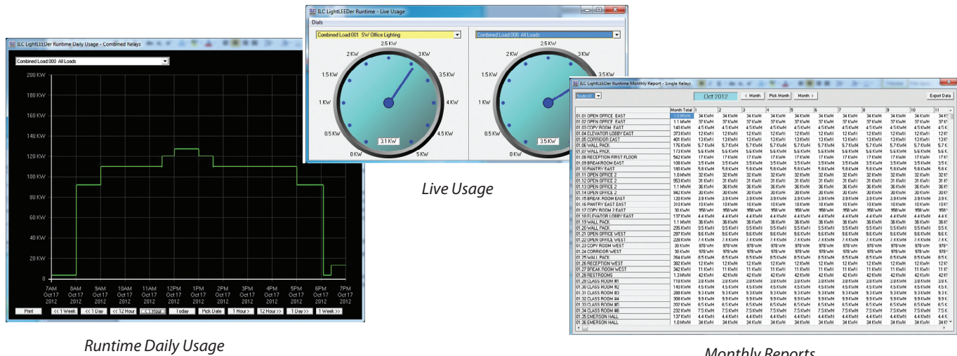
Runtime Daily Usage