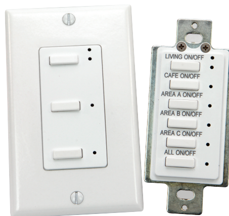
Available in White , Ivory and Gray

The LightSync G2 data line pushbutton switch station offers all the functions of the classic LightSync switch but is more affordable and flexible. Switch stations are available with 1 to 6 pushbuttons and have a status LED associated with each button along with a locator LED that is always lit. Each button may be individually programmed to control any relay(s), group(s) or preset(s) throughout the network. Switch faceplates are removable and can be laser etched for switch identification.