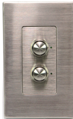
Plate not included

The LightSync Digital Touch Switch Station offers a durable switch that is resistant to impact and vandalism. Switch stations are available with 1 to 3 highly durable push button switches and have a status LED associated with each button. Each button may be programmed to control any relay(s), group(s) or preset(s) throughout the network. Switch Stations are available in four colors or stainless steel.